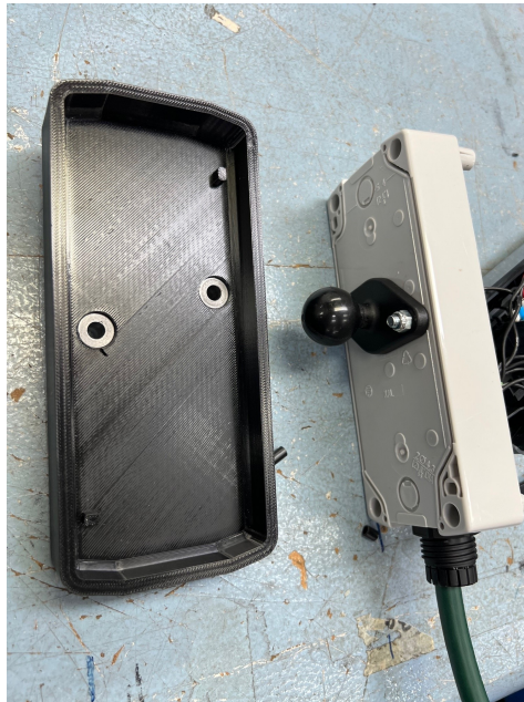
3D Printed Drilling Guide with metal inserts

In the fabrication of some components, precise drilled holes are required, Drill guides are used in order not to have to measure and mark each part as it comes through the station. The drill guide is placed over the part, and shows where the holes are required.