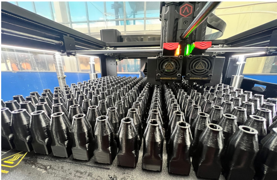
Bed of Wiring harness parts being Printed on the Raise3D Pro 3 Plus