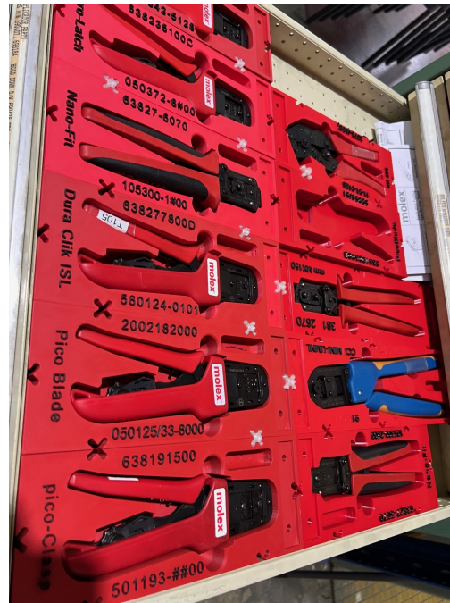
3D Printed Hand Tool Holders