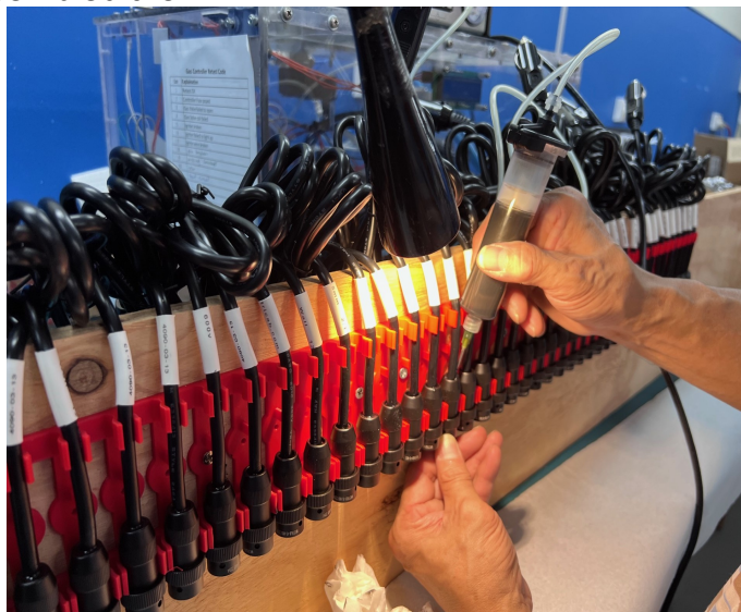
3D Printed Assembly Fixture

Some stages of assembling a complex product can be made much easier with purpose built fixtures, which hold a sub-assembly in a given orientation, making it much easier to attach more components, hardware and wiring. Assembly fixtures also help with making a standardised and streamlined process so that all assembly operator are following the exact same steps, ensuring all products are identical rather than having slight differences depending on who assembled them.