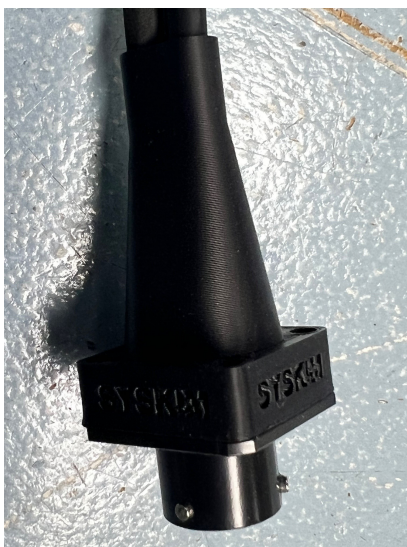
3D Printed Wiring Connector Part

Wiring Systems also have been using their Raise3D Pro3 Plus to print parts for their wiring harnesses. The 3D printing process enables new design iterations of the parts to be produced immediately and at no additional cost, whereas if the parts were made with another process such as injection moulding, each design iteration is very costly and has a long delivery time.