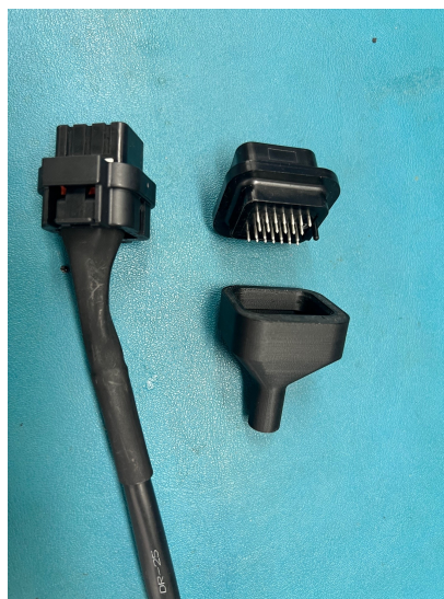
3D Printed Shroud for Wiring Connector